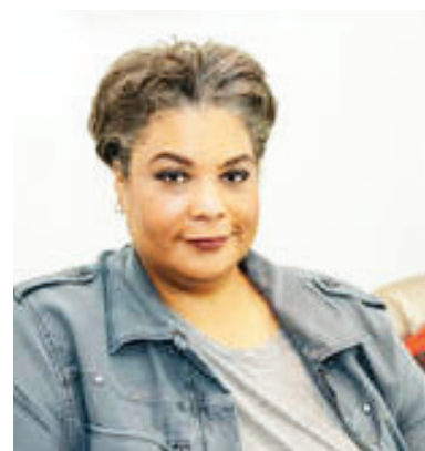
ROXANE GAY presents OPINIONS: A DECADE OF ARGUMENTS, CRITICISM, AND MINDING OTHER PEOPLE'S BUSINESS