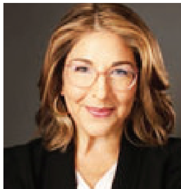
NAOMI KLEIN presents DOPPELGÄNGER: A TRIP INTO THE MIRROR WORLD September 20, 7pm