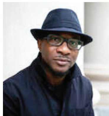
TEJU COLE presents TREMOR October 23, 7pm

For tickets please visit: berkeleyarts.org .