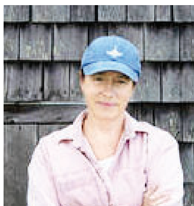
HEATHER COX RICHARDSON presents DEMOCRACY AWAKENING: NOTES ON THE STATE OF AMERICA October 4, 7pm