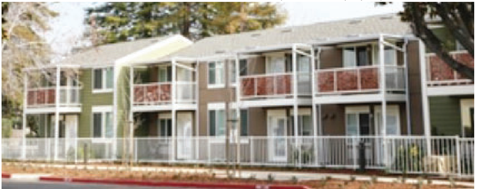
Fargo Senior Homes features 75 low-income units for seniors 62 and older.

I would be delighted for feedback or additional ideas for field trips, presentations or other events which may be of use to us as we consider what we may do with our property and resources.